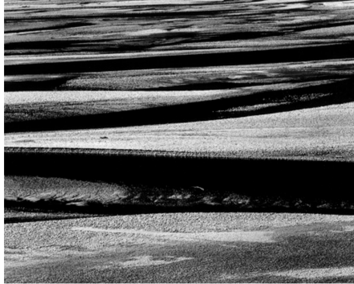
Lines, Dart River

How often when a group of people are looking at a photograph that is not easily recognizable do you hear the comment “What is it? Well it’s an abstract of course!”